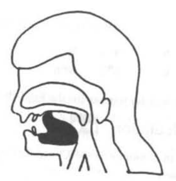
Diagram 1 Position of the tongue for the Panjabi [t, t, d, d, \eta , t]

The tongue curls back and the underside of the tongue touches the part of the palate behind the gum ridge. There are no equivalent sounds in English. It is important to use the underside of the tongue for all the sounds of this group and also for r. The curled tails of the symbols for these consonants should serve as a reminder that the tongue should be curled when you pronounce them. The following diagram can be helpful.